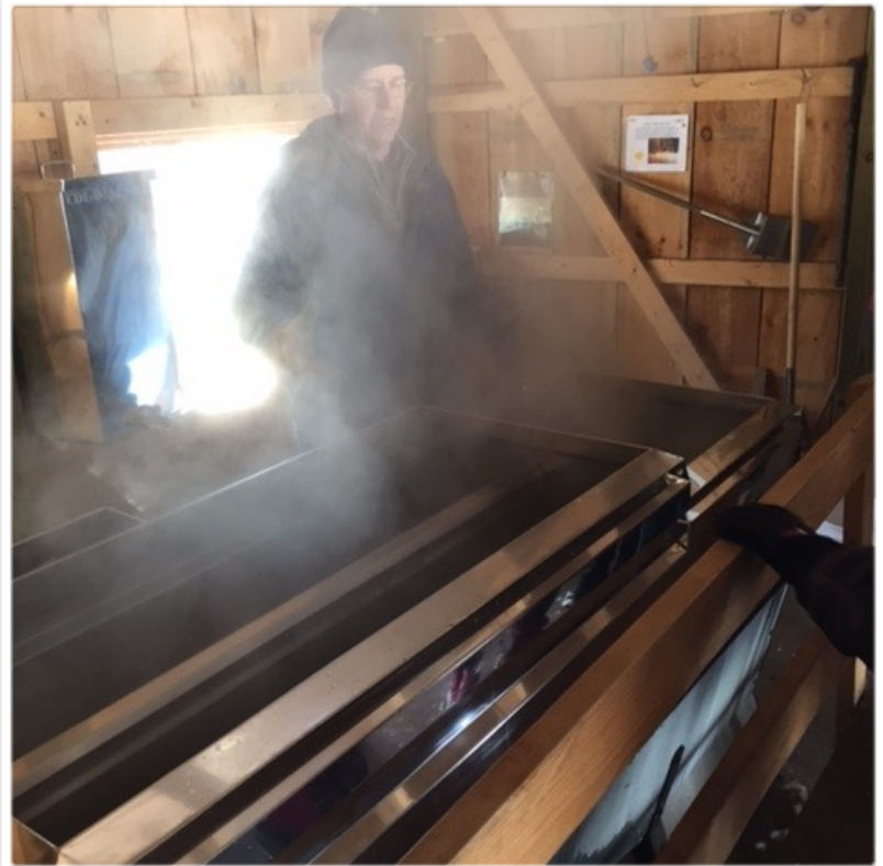
Making Maple Sugar

We are finishing up our study of light. We recently finished looking at how light interacts with color. We will finish our unit with a guest speaker (Mrs. Bergeon) joining us to demonstrate a cow eye dissection and learn how the eye processes light.