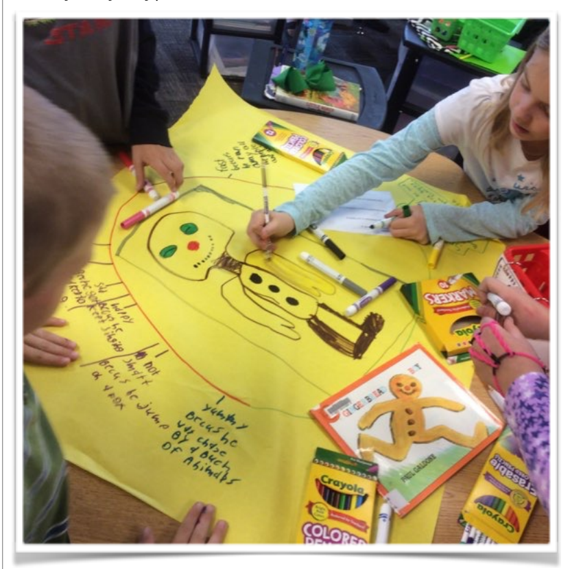
Project Based Learning—Fairy Tales and Character Traits!

We are deep into our study of the Northeast region. We have been learning that we read nonfiction differently than fiction. With nonfiction, we read for specific information. We have been learning about the landforms and the products and natural resources of the Northeast Region. We also had a Mystery Skype with a class in Alaska!