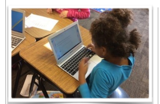
Leaving Quality Comments on our Blog