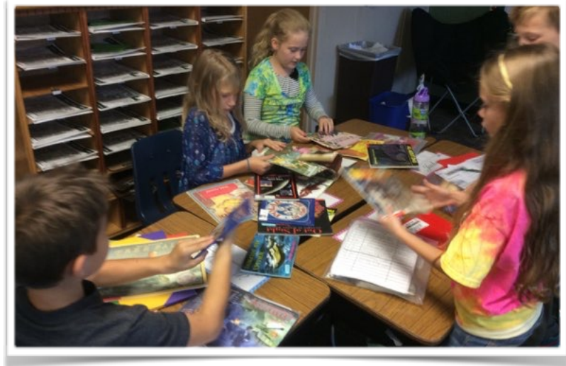
Sorting Fiction and Nonfiction