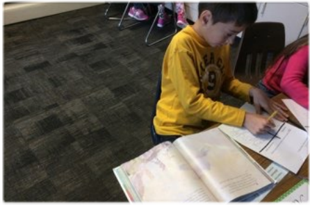
Searching for compound words.