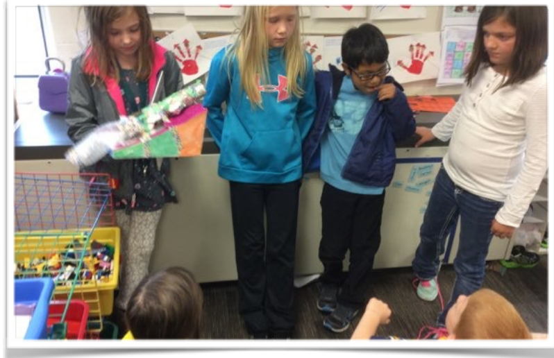
Sharing our PBL Projects with kindergartners.