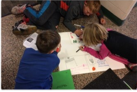
Creating a poster about the Southeast Region of the US.