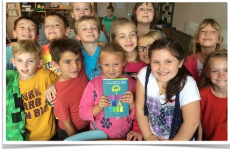
Excited About the Global Read Aloud!