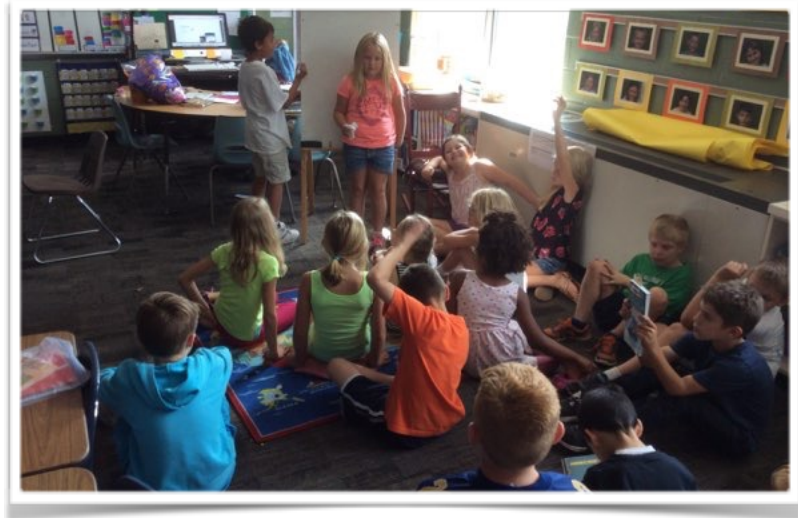
End of the day Recapping