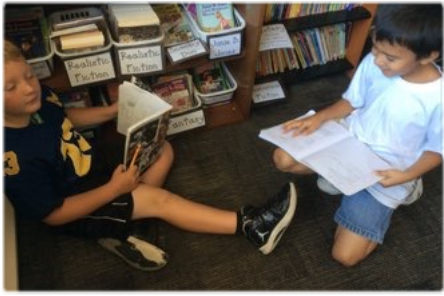
Sharing our Stories